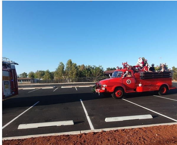
1 - Santa approves of our new carpark!!